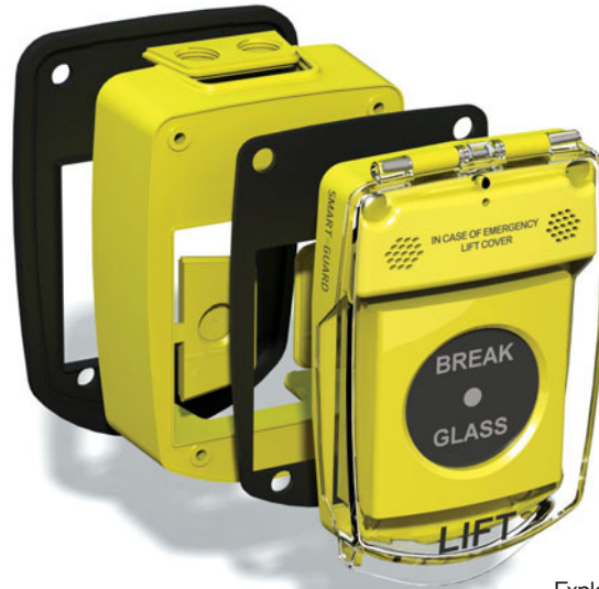
Exploded view of the Smart+ Guard Enviro showing gasket and spacer arrangement

Applications include off-shore, the food and beverage industry, swimming pools and leisure centres, underground installations and any area where exposure to the environment is likely to cause damage to control equipment or switching devices.